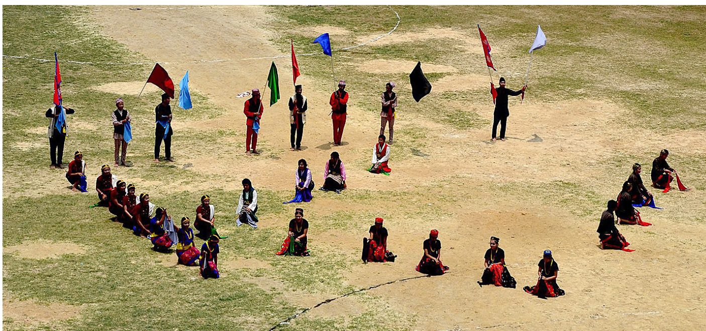
KU Shape Formed by Performers During “Sports Week 2016” Inauguration Ceromony