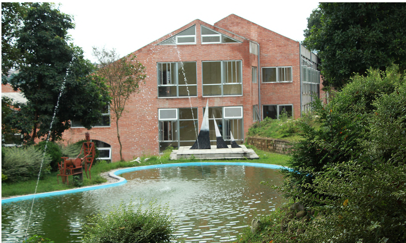
New Building (Block 9) After Substantial Handover

25 years OF QUALITY EDUCATION (1991 - 2016) KATHMANDU UNIVERSITY