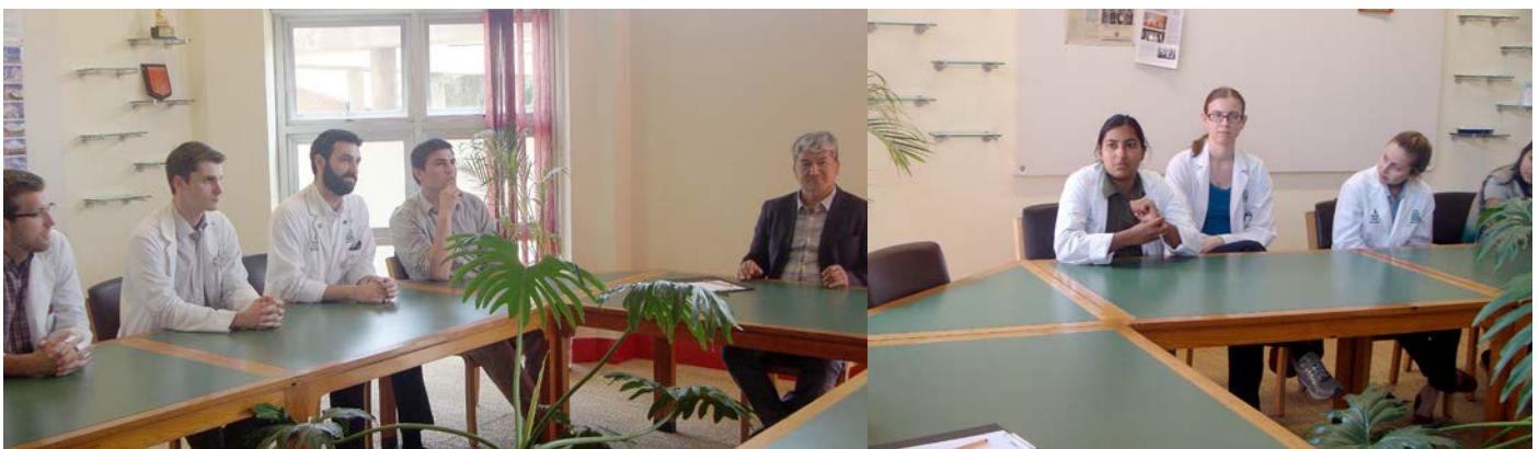
International Students at Kathmandu University