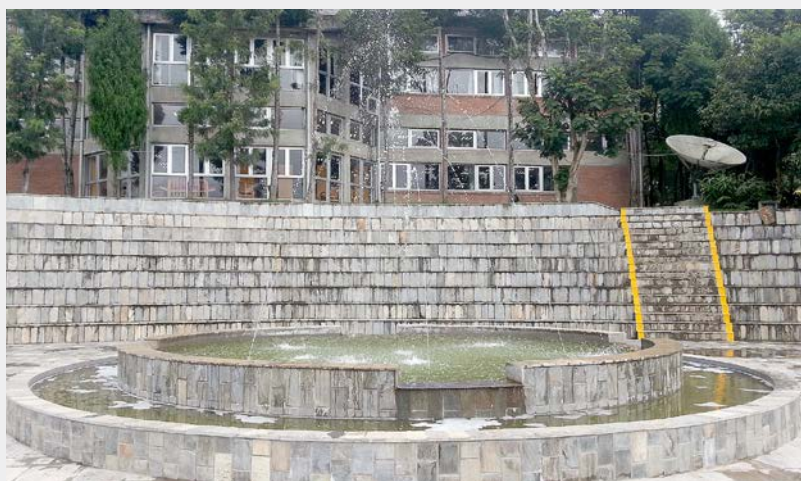
A glimpse of KU central premises.