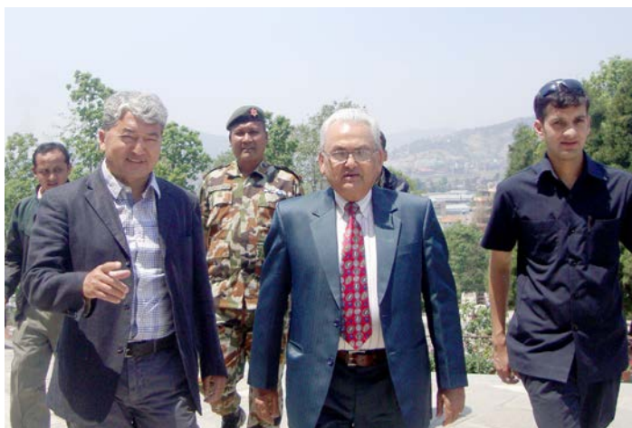
Hon'ble Minister of Foreign Affairs Mr. Mahendra Pandey at Kathmandu University.