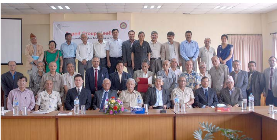
Participants in the Experts Meeting