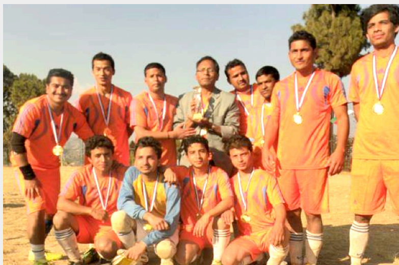
KU staff football team after the victory on The Fourth KU- Staff cup 7'A' Side football Tournament organized on 31 January 2014