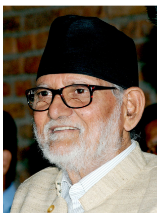
Rt' Hon'ble Prime Minister and Chancellor of Kathmandu University, Sushil Koirala.