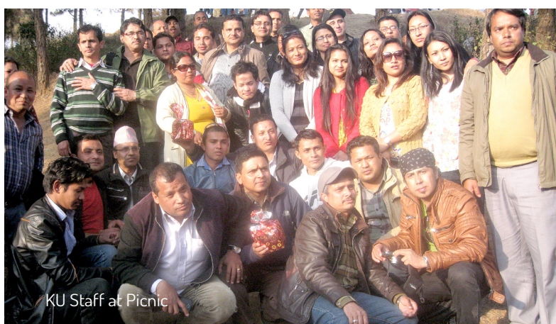
KU Staff at Picnic