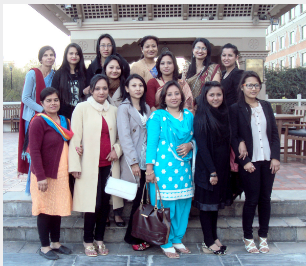
KU staff at Hyatt Regency to celebrate Women's Day