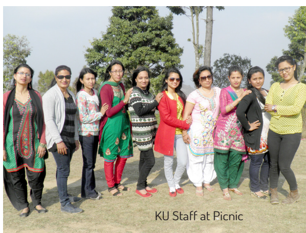
KU Staff at Picnic