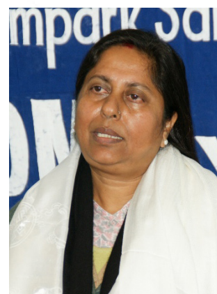
Hon'ble Education Minis- ter and Pro-Chancellor of Kathmandu University, Mrs. Chitralekha Yadav.