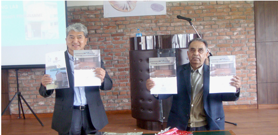
Second Anniversary Issue of Turbin Testing Lab.