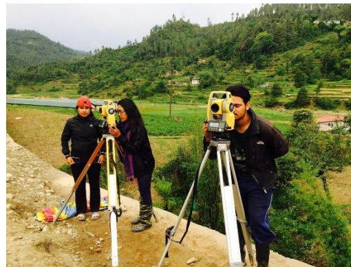
Students doing engineering survey in close camp