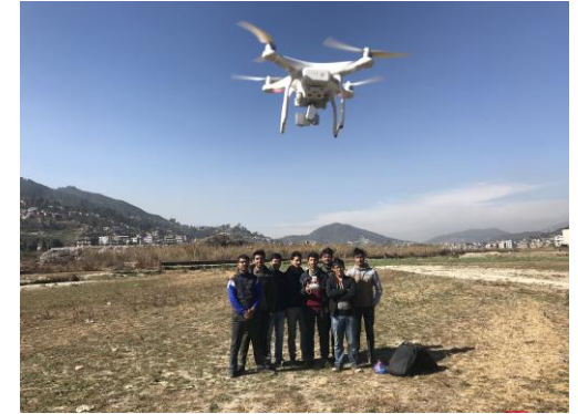
UAV Photogrammetry Practical Work