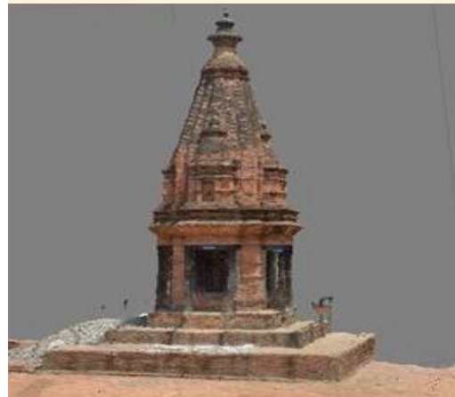
A textured 3D model of Shree Pashupati Temple, Panauti

“We don’t merely teach courses; we enhance your professional competence through regular semester as well as externally funded projects, and industrial internship.”