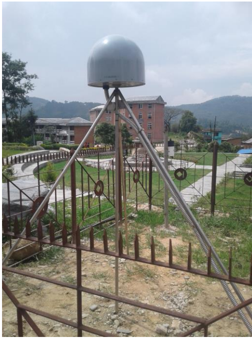
Continuously Operating GPS station at KU Central Campus